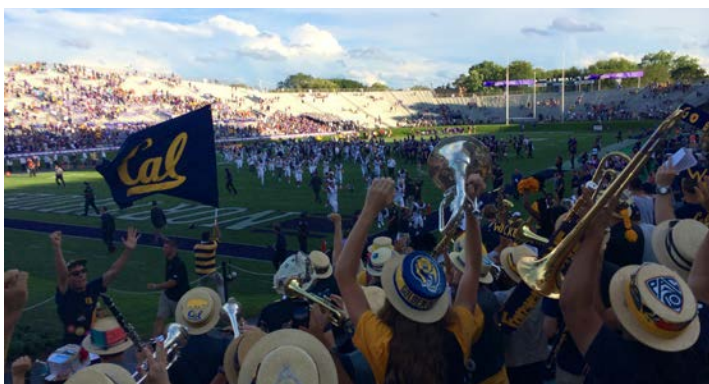
The Band performs at Northwestern on August 30.