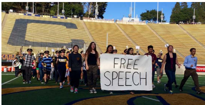
The Band rehearsing the Free Speech Movement Show in Memorial Stadium.

has been directly or indirectly affected by cancer. The month our halftime show ideas were due, I had a few family friends who were really struggling with their battles against cancer. Being extra pensive about cancer, I just happened to do a YouTube search for "Stand Up to Cancer" themed marching band halftime shows, and to my surprise there was little to none. I thought that this "Stand Up to Cancer" themed show would not only be Cal Band's chance to be among the first marching bands to perform this type of show for a large public audience, but it would also touch the hearts of many and especially empower those who are currently battling against cancer." The show featured Edward Cummings' arrangements of David Guetta's Titanium , Katy Perry's Roar , and Gloria Gaynor's I Will Survive , songs whose lyrics remain united in their themes of finding strength and empowerment in times of adversity.